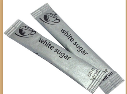
No. 17589 WHITE SUGAR STICK (SILVER) 2000*3GISM