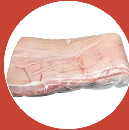
No. 17748 Fresh Pork Belly B/L R/On 5kg (3) Vac R/W