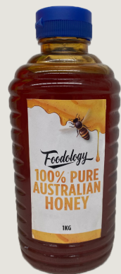
No. 18413 HONEY - AUSTRALIAN 1KG (8) FOODOLOGY