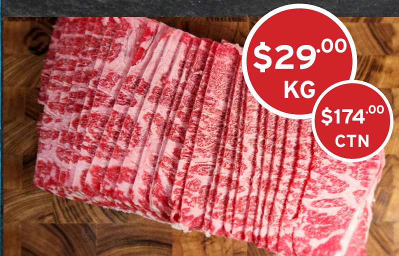
No. 16764 FZ WAGYU - SLICED OUTSIDE FLAP MB9+ 2MM KOREAN STYLE 2KG(3)