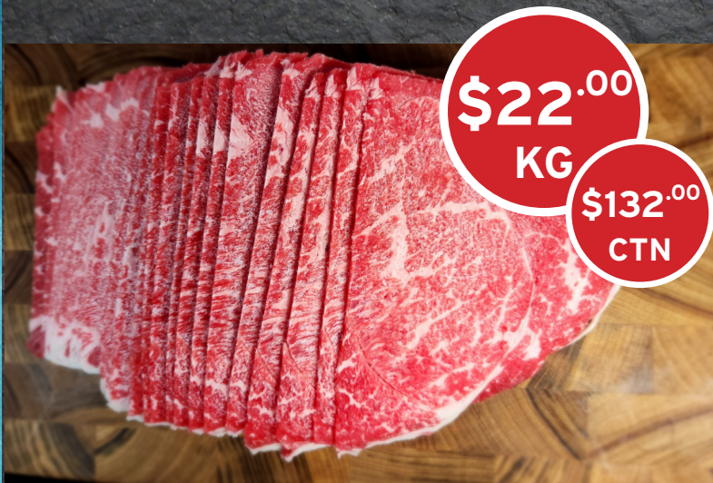
No. 10689 FZ WAGYU - SLICED MB 4-5 2MM KNUCKLE 2KG(3)