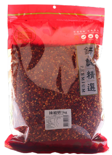
No. 28087 CHILLI - FLAKE / CRUSHED 1KG CSI