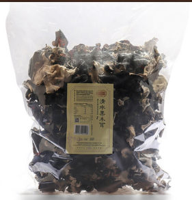
No. 12381 BLACK FUNGUS WHOLE LARGE 1KG CSI