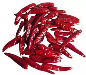
No. 15808 CHILLI - SMALL WHOLE DRIED EXTRA HOT INDIA 1KG