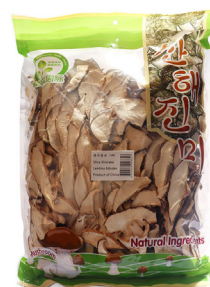
No. 13454 DRY MUSHROOM SLICE 1KG(12) CSI