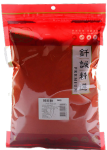
No. 12178 CHILLI - POWDER / GROUND 1KG CSI