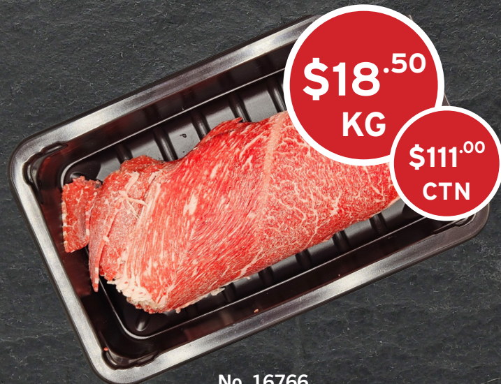
No. 16766 FZ WAGYU - SLICED BOLAR MB4-5 2MM KOREAN STYLE 1KG (6)