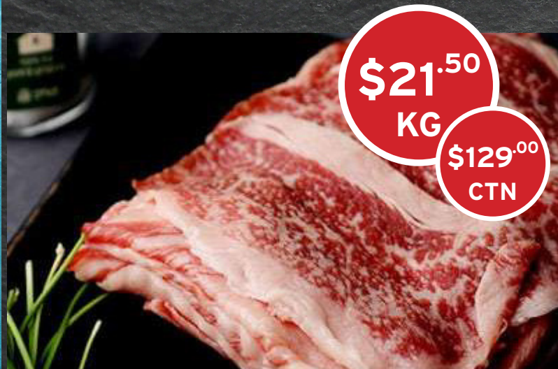
No. 16535 FZ WAGYU - BRISKET SLICED MB3+ 2MM KOREAN STYLE 2KG(3)