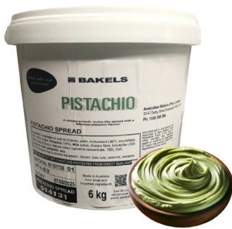
No. 12354 SPREAD - PISTACHIO SPREAD 6KG BAKELS