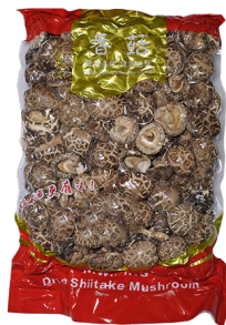
No. 12318 DRIED SHITAKE MUSHROOMS 1KG CSI