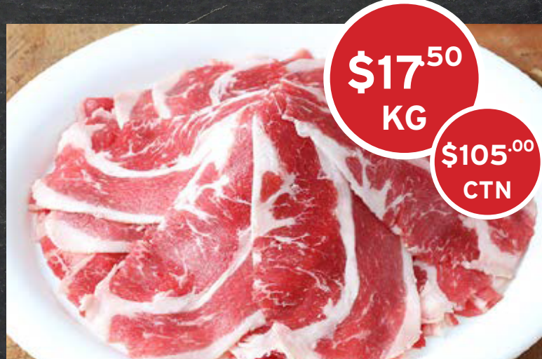
No. 16532 FZ BEEF - ANGUS BRISKET SLICED 2MM KOREAN STYLE 2KG(3)