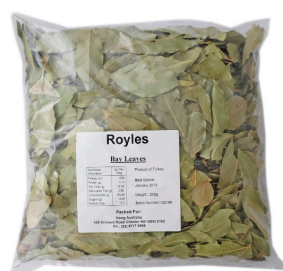
No. 18430 DRY HERBS - BAY LEAVES 200G