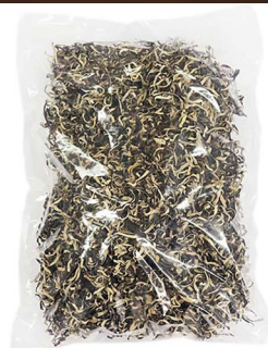
No. 17034 BLACK FUNGUS STRIPS 1KG CSI