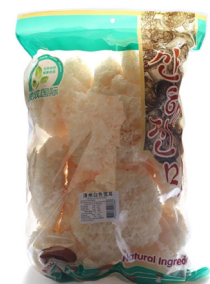
No. 21356 WHITE FUNGUS 400G CSI