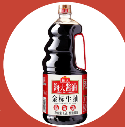
No. 18964 Sauce - Light Soy Sauce Golden Label 1.9l (6) Haday