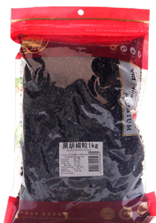
No. 17400 PEPPER - WHOLE BLACK 1KG CSI