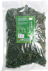
No. 13392 SPICE - GREEN SICHUAN PEP- PERCORN 500G CSI