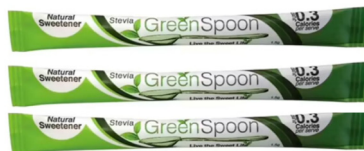
No. 19143 GREENSPOON SWEETENER 100% NAT. 500x1.5G STEVIA