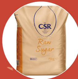
No. 16209 Sugar Raw 15kg