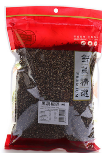
No. 19588 PEPPER BLACK CRACKED SS 1KG CSI