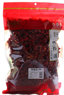
No. 12170 CHILLI - RING / CUT DRIED HOT 1KG CSI