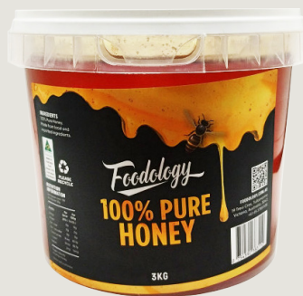
No. 18409 HONEY 3KG (4) FOODOLOGY