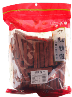
No. 12175 CINNAMON STICKS 1KG CSI