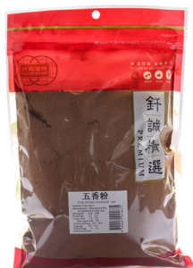
No. 31018 SPICE - CHINESE FIVE SPICE 1KG (12) CSI