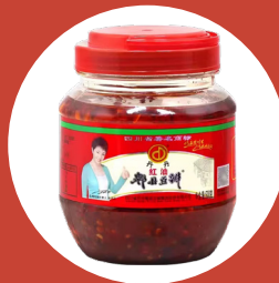
No. 16832 Sauce - Pi Xian Chilli Bean Sauce 1.2kg(8) Dan Dan