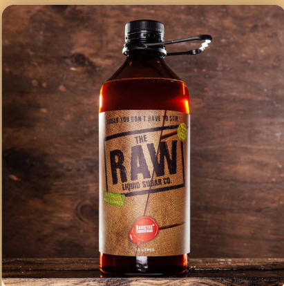
No. 14001 SYRUP - LIQUID SUGAR 1.5L (6) REAL