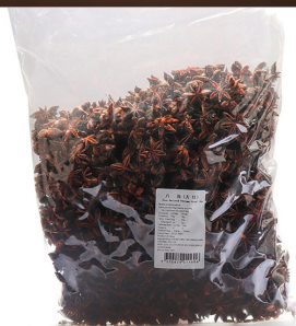
No. 18371 SPICE - STAR ANISE WHOLE 1KG CSI