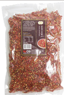
No. 13391 SPICE - RED SICHUANG PEP- PER RED 500G CSI