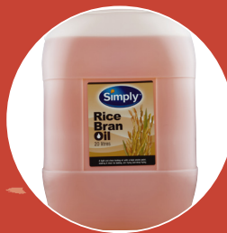
No. 16805 Oil - Rice Bran Oil 20l Jerrycan Simply