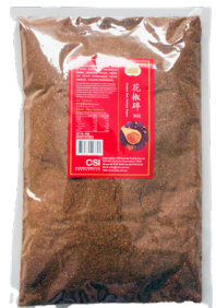
No. 18456 SPICE - CRUSHED RED SICH- UANG PEPPER 1KG CSI