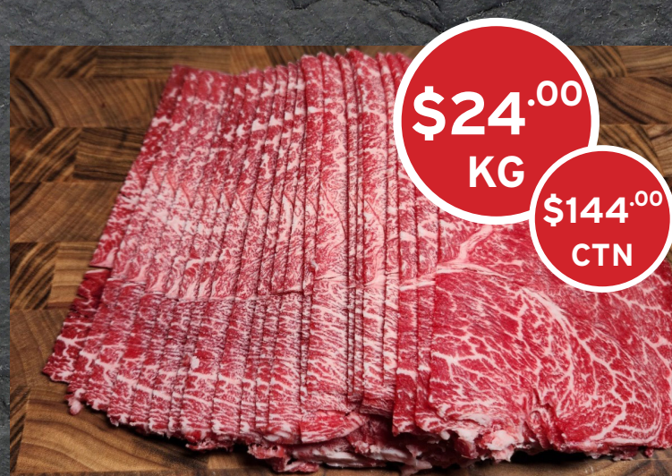
No. 16534 FZ WAGYU - SLICED MB8+ 2MM KNUCKLE KOREAN STYLE 2KG(3)