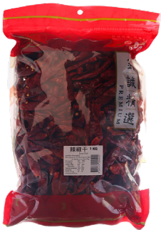
No. 15905 CHILLI - LARGE WHOLE DRIED MILD HOT CHINA 1KG CSI