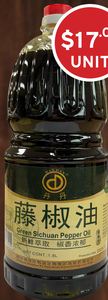
No. 12393 SEASONING OIL GREEN SICHUAN PEPPER ( TENGJIAOYOU ) 1.8L (6) DAN DAN