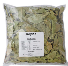
No. 18430 DRY HERBS - BAY LEAVES 200G