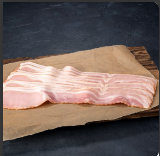
No. 70675 BACON - RINDLESS MIDDLE 2.5KG(2) # 35350 TIBALDI