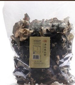
No. 12381 BLACK FUNGUS WHOLE LARGE 1KG CSI