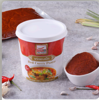
No. 11060 PASTE - RED CURRY 1KG IN TUB (12) MAE SUPEN