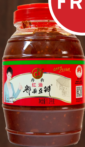
No. 16832 SAUCE - PI XIAN CHILLI BEAN SAUCE ( DOUBANJIANG ) 1.3KG DAN DAN