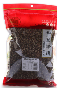
No. 19588 PEPPER BLACK CRACKED SS 1KG CSI