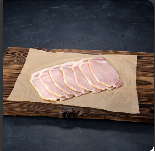
No. 13466 BACON - CAFE BACON (HALF TAIL) 1KG (12) TIBALDI