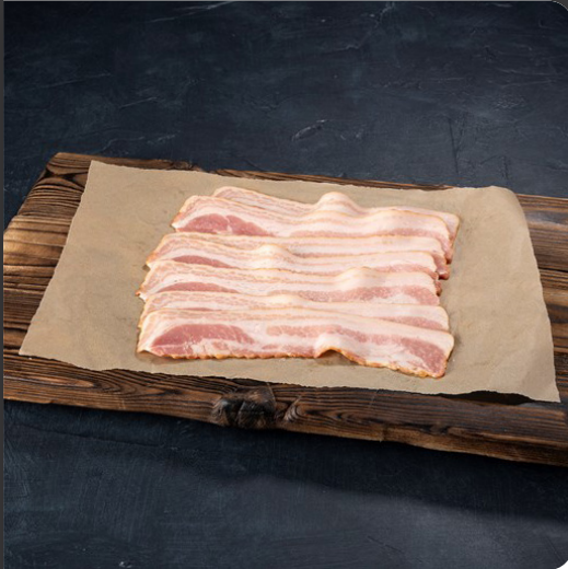
No. 11891 BACON - STREAKY BACON 2.5KG X 2 TIBALDI