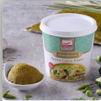
No. 11061 PASTE - GREEN CURRY 1KG IN TUB (12) MAE SUPEN