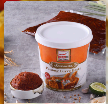
No. 11064 PASTE - PANANG CURRY 1KG IN TUB (12) MAE SUPEN