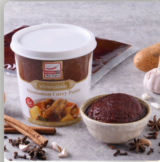
No. 11063 PASTE - MASSAMAN CURRY 1KG IN TUB (12) MAE SUPEN