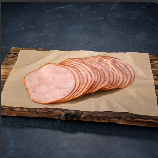
No. 13898 HAM - SMOKEY VIRGINIAN SLICE 1KG (4) TIBALDI