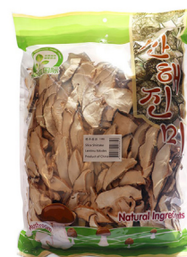
No. 13454 DRY MUSHROOM SLICE 1KG(12) CSI