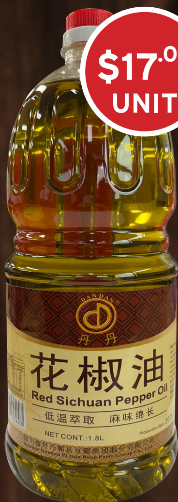
No. 12389 SEASONING OIL RED SICHUAN PEPPER OIL ( HUAJIAOYOU ) 1.8L (6) DAN DAN