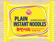
No.18120 라면사리(미국) 110G Plain Instant Noodle 110g (48)