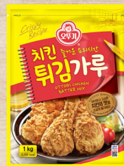
No.18171 치킨튀김가루 1KG Chicken Batter Mix 1kg (10)